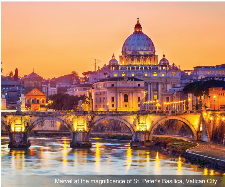
Marvel at the magnificence of St. Peter's Basilica, Vatican City

Forum, you will be strolling amongst historic ruins of political buildings, shrines, temples and monuments, some dating back to the first kings of Rome. After a morning of historic discovery, enjoy an afternoon and evening at leisure. Meal: B