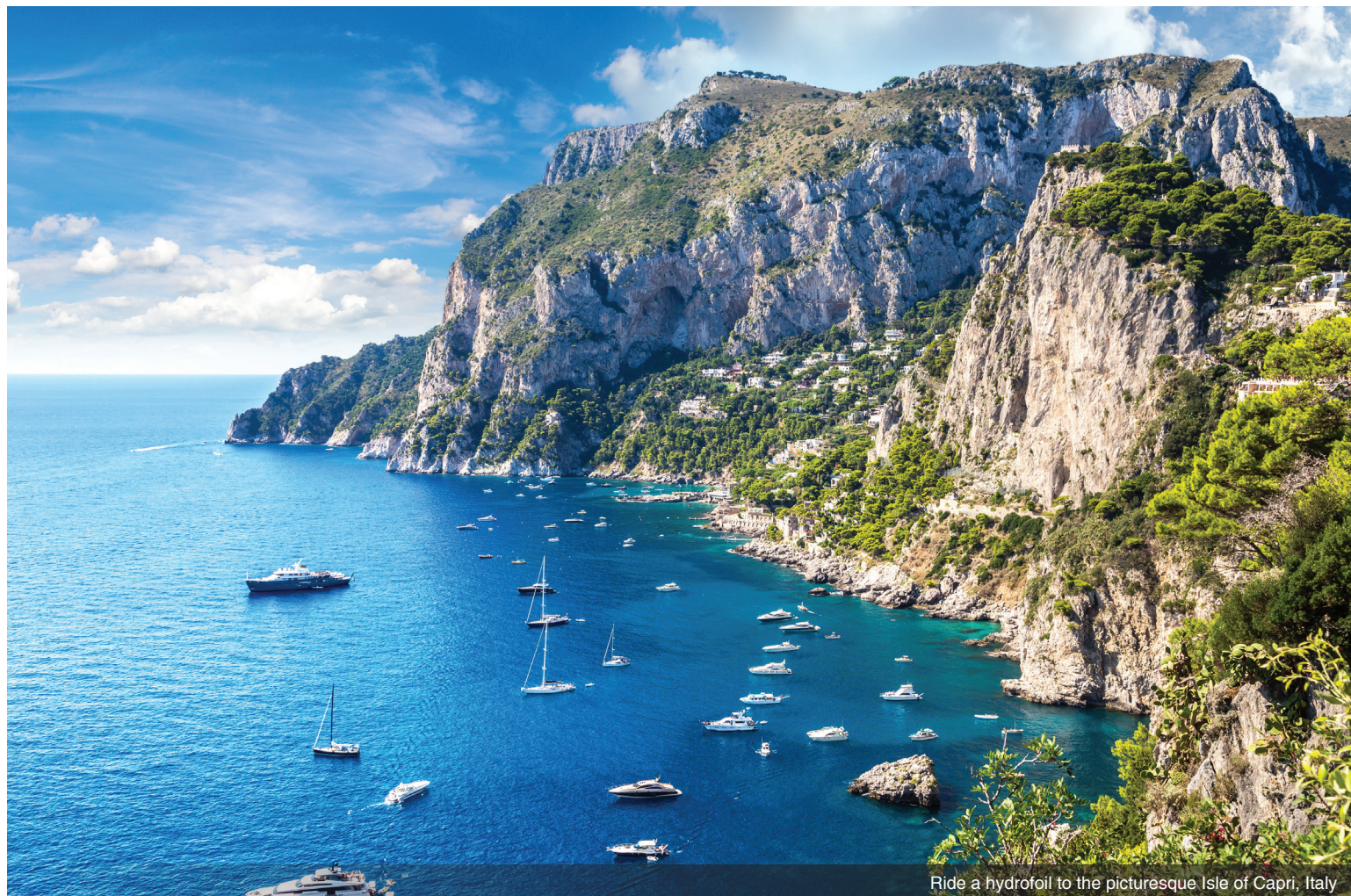
Ride a hydrofoil to the picturesque Isle of Capri, Italy