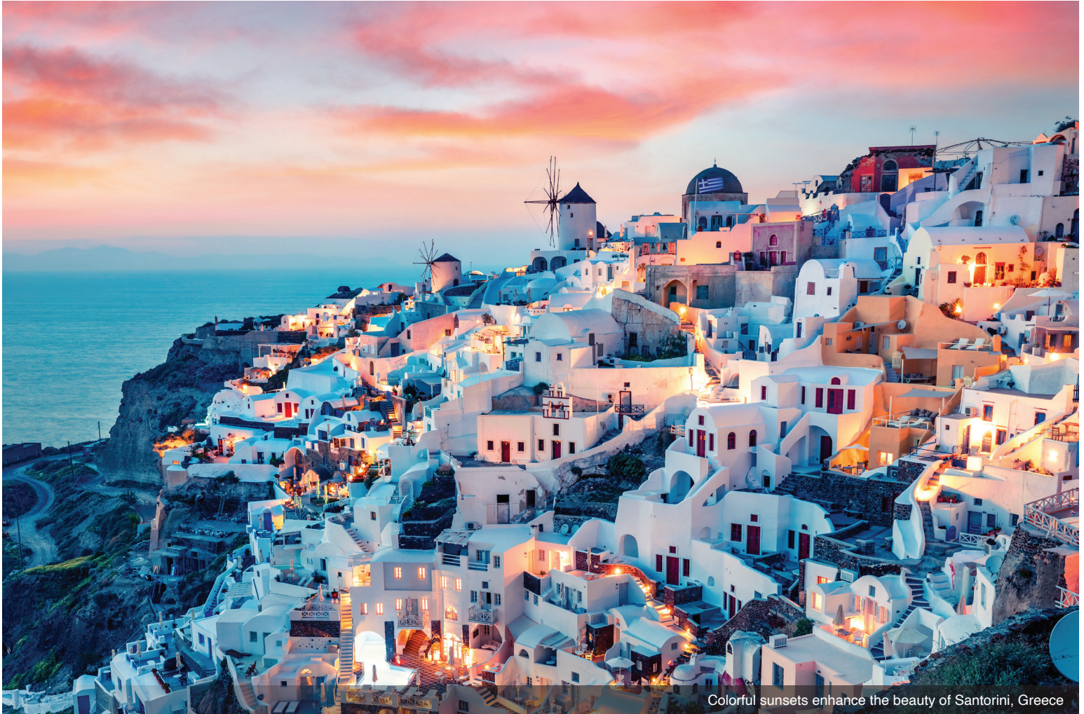
Colorful sunsets enhance the beauty of Santorini, Greece