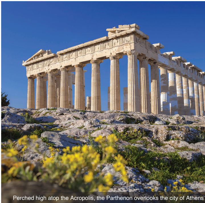
Perched high atop the Acropolis, the Parthenon overlooks the city of Athens