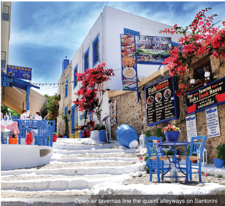
Open-air tavernas line the quaint alleyways on Santorini

remainder of the day at leisure. Browse in the boutiques, visit the beach or simply enjoy people-watching and meeting the locals at a sidewalk café. Meal: B