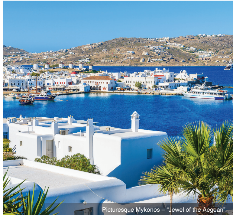
Picturesque Mykonos – “Jewel of the Aegean”

DAY 1 Depart the USA: Depart the USA on your overnight flight to Athens, Greece, a city with a history that dates back almost four millennia.